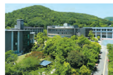
*Tracks Offered: IJL, RCJ, RCE

Kinugasa Campus (KIC) is the perfect example of Kyoto's harmonization between the traditional and the modern, and is a serene environment for education. Kinugasa is the university's center of liberal arts, social science and humanities studies.