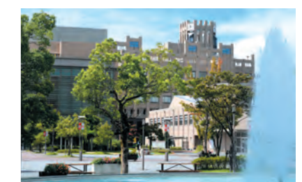
*Tracks Offered: RCJ, RCE

Biwako-Kusatsu Campus (BKC) serves as a center of education and research that integrates the sciences with the humanities. The campus is surrounded by natural beauty with mountains to the west and Lake Biwa, Japan's largest lake, to the east.