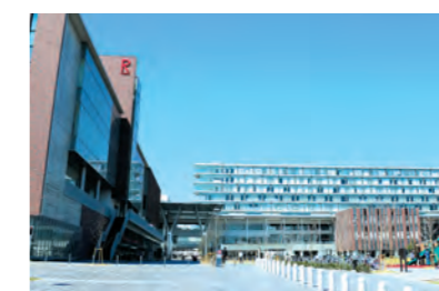
*Tracks Offered: RCJ, RCE

Located midway between Osaka City and Kyoto City, Osaka Ibaraki Campus (OIC) is RU's newest campus. The campus community works to facilitate collaboration with industry and government institutions and promote Ritsumeikan's activities on the frontline of social collaboration.